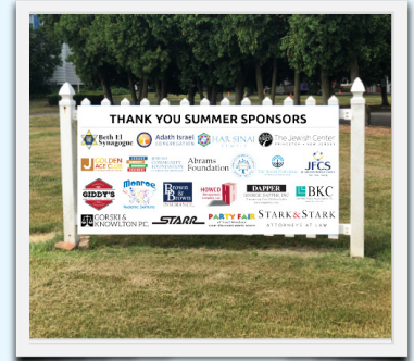
Sponsorship Campus Banner