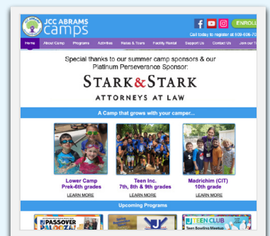
Logo on Website