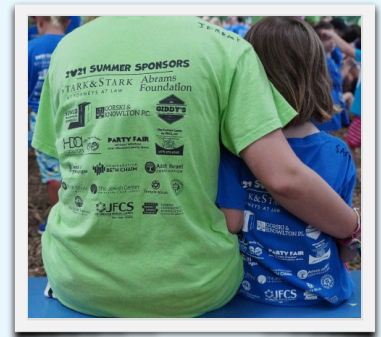
Logo on T-shirts